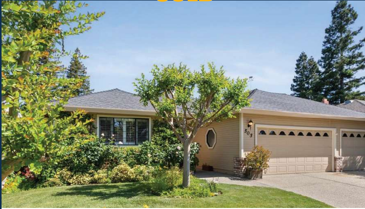
505 Valim, Greenhaven/Pocket