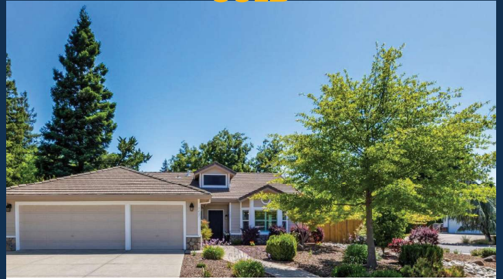
7427 Rio Mondego, Greenhaven/Pocket