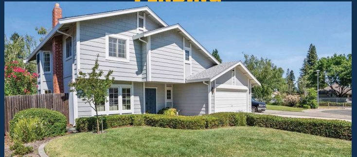
9 Lourdes Court, Greenhaven/Pocket