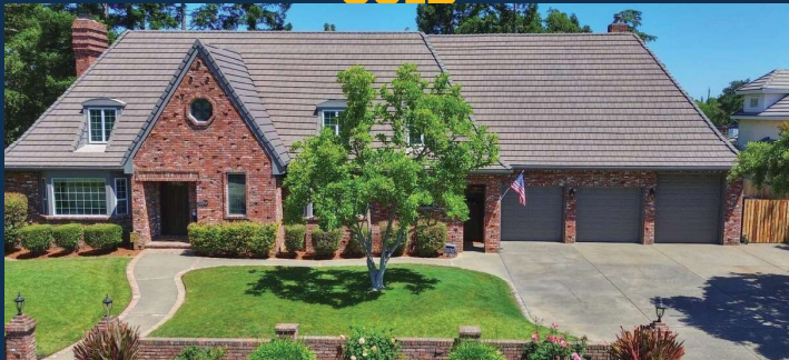
5509 Oak Hills Court, Carmichael