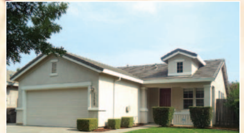
1548 Union Square – West Sacramento