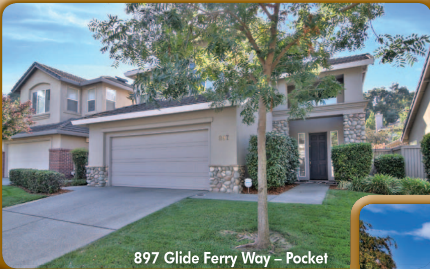
897 Glide Ferry Way – Pocket