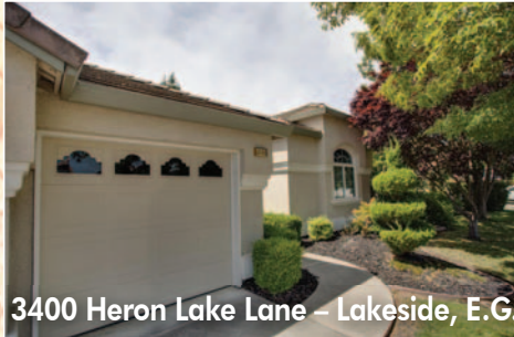
3400 Heron Lake Lane – Lakeside, E.G.