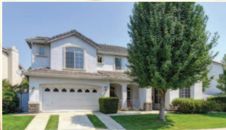
2513 Marshalynn Way – Elk Grove