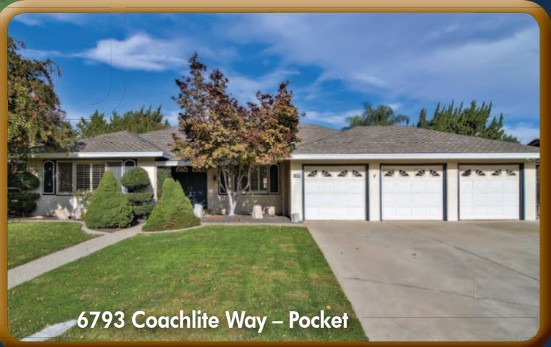
6793 Coachlite Way – Pocket