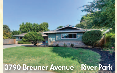
3790 Breuner Avenue – River Park