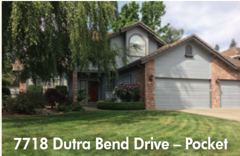
7718 Dutra Bend Drive – Pocket