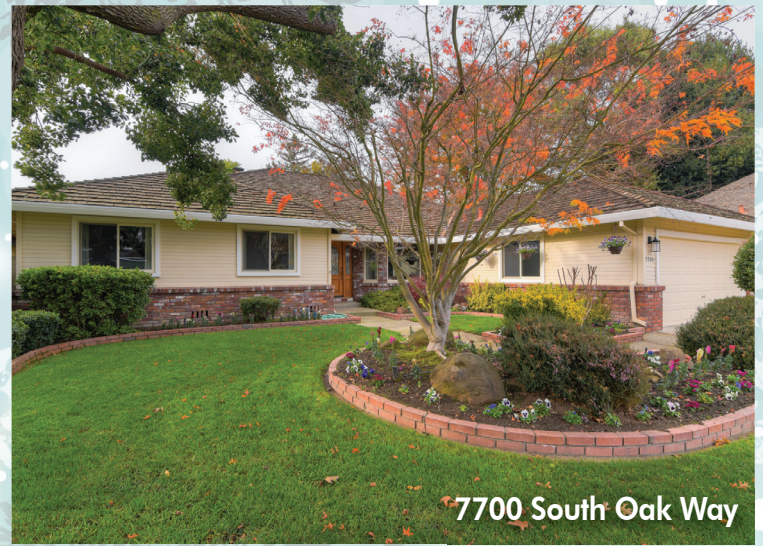
7700 South Oak Way