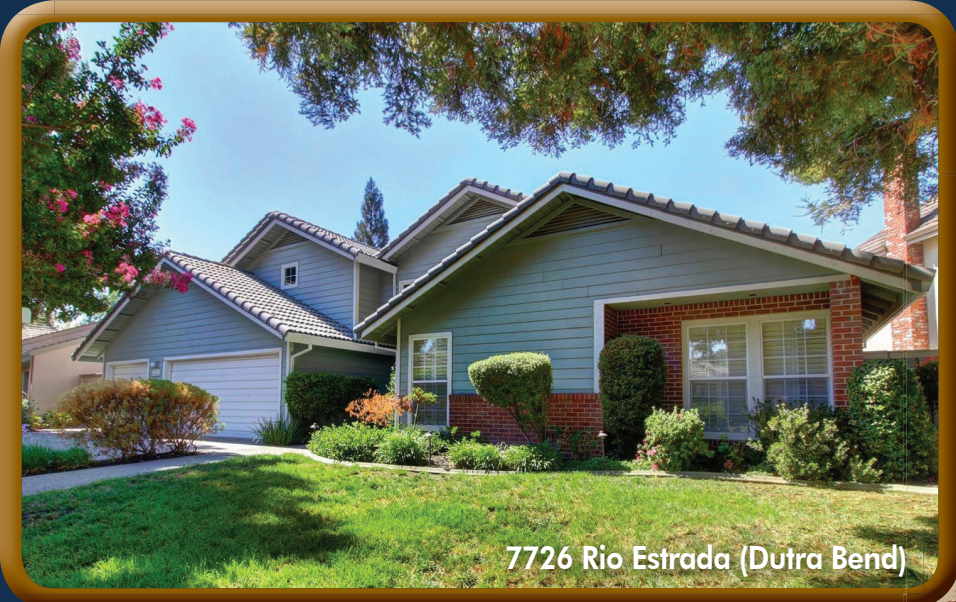
7726 Rio Estrada (Dutra Bend)

No matter the day, I'm here to help you with your next residential real estate transaction.