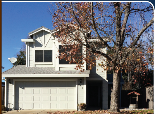
341 Blue Dolphin (Garcia Bend area)