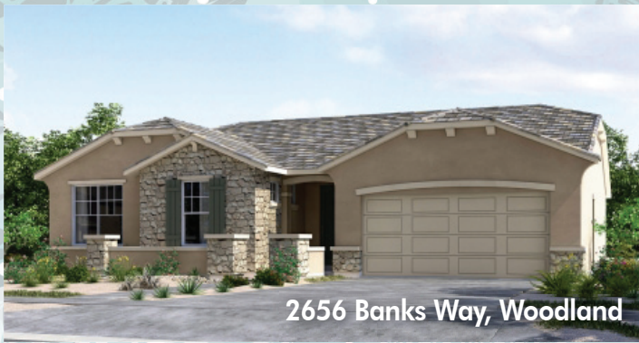
2656 Banks Way, Woodland